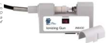
The replaceable filter on the IN6430 assures a clean flow of ionized air

Ionizers that use Ptec™ technology do not require calibration and only minimal maintenance.